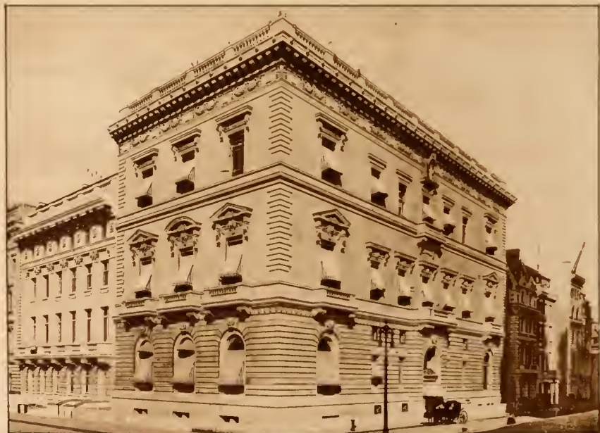
UNION CLUB, Fifth Avenue and 51st Street.